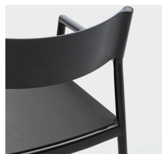
Oak Veneer Black Lacquer