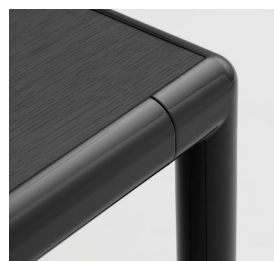
Oak Veneer Black Lacquer (Legs Glossy or Textured)