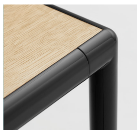
Oak Veneer (Legs Glossy or Textured)