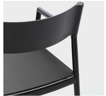
Oak Veneer Black Lacquer